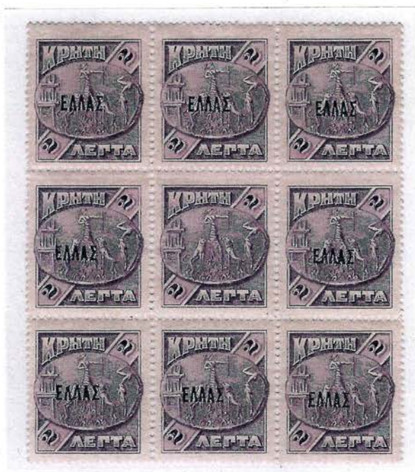
2l. missing overprint error (A55)

The use of Plate A resulted in the missing overprint printing error on position 55 as well.