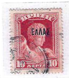
10l. (1907) first Λ less broken at top (A64)