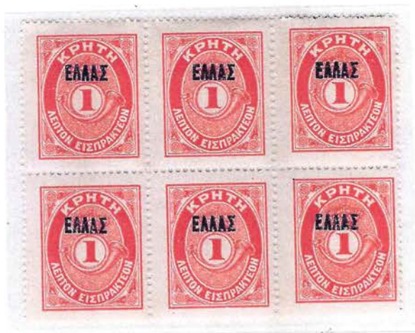
1l. postage due stamp, right leg of A cut (C69)

Observing the clarity of the typographic elements in the case below, we understand that the quality of the Plate C overprints varies, depending on the sequence of values' overprint.