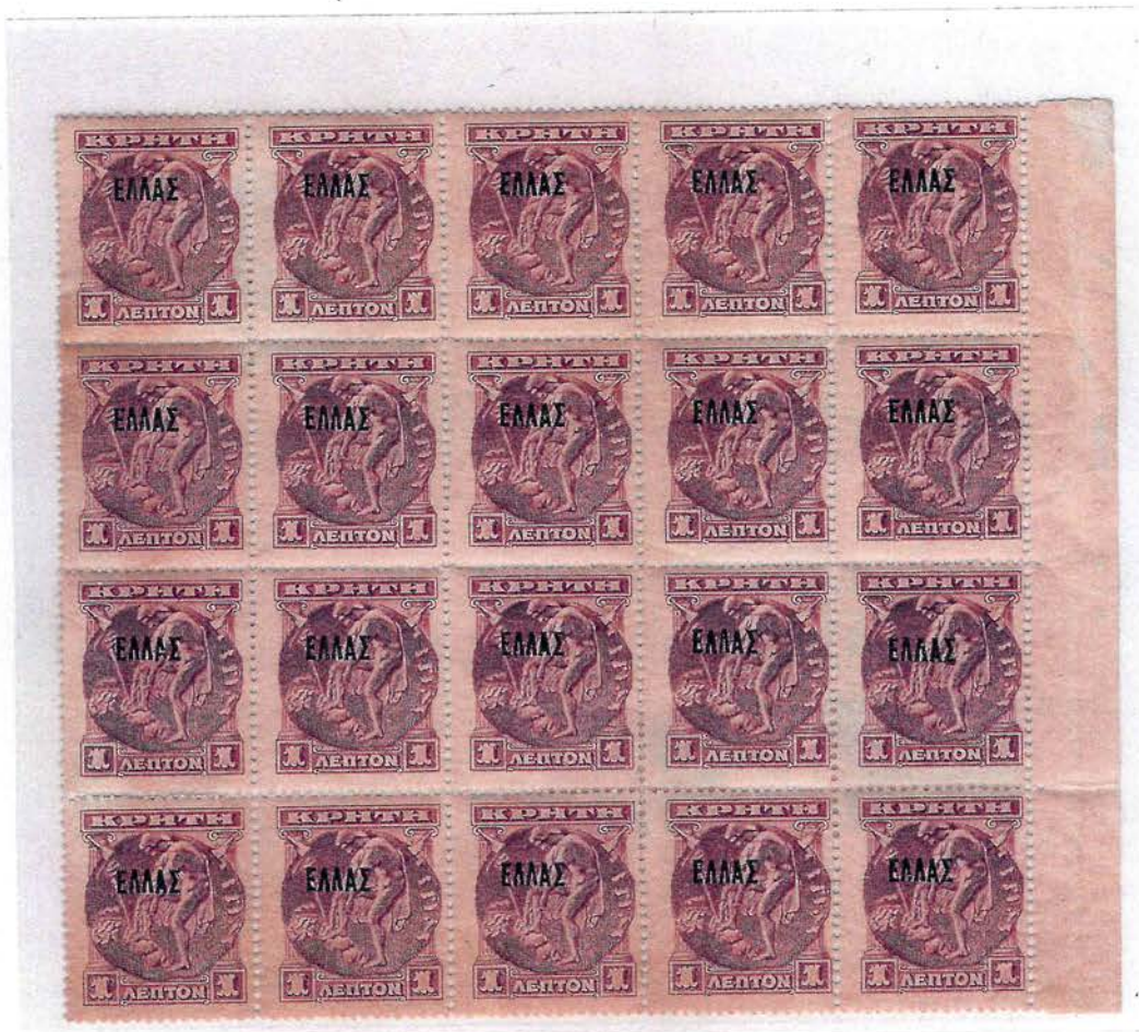
1l. right leg of A cut (B76) and second Λ wide (B80)