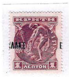
1l. misplaced overprint

A final printing error documented is that of the misplaced overprint , which appears in both small and large values.