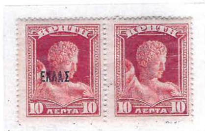
10l. (1907) missing overprint error (B66)

The overprint variety right leg of A cut will be presented later in the exhibit.