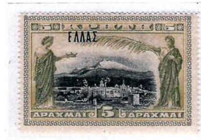
5dr. foot of E short (A51)