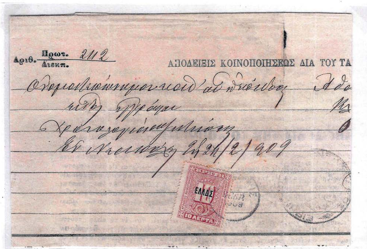
10l. for official use (1908), ΕΛΛΑΣ error (B48)

It is noted that, unlike the postmark of the post office of ΣΟΥΔΑ (Souda) which appears very often on stamps with private ΕΛΛΑΣ (1908) overprints, the ΚΟΛΥΜΠΑΡΙ (Kolymbari) postmark appears in cases of stamps with genuine overprint errors.