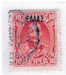
10l. (1900) head of Σ bending downwards (A75)

Head of Σ bending downwards, position 75 (small sized values)