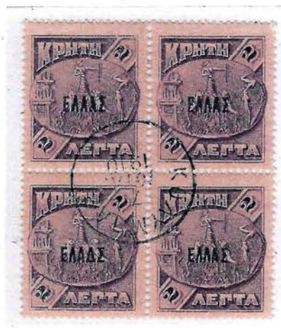
2l. ΕΛΛΑΣ error (B48)

The use of Plate B also resulted in the following printing errors: