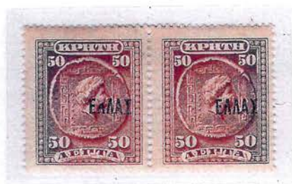
50l. first Λ much broken at top (A38)

First Λ much broken at top, positions 38 (small sized values), 13 (horizontal stamps) και 70 (2 drachmae value)