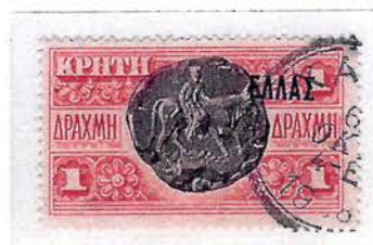
1dr. value, First Day of Circulation

In the fall of 1908, following the one-sided proclamation of Union with Greece by the Cretan Government, the latter proceeded with the overprinting of a series of stamp values with the word ΕΛΛΑΣ (Decree of September 26 th , 1908, JD), and the first day of circulation of the new stamps was set for the 6 th of October, 1908.