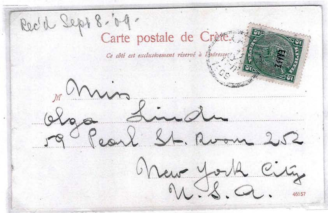
5l. right leg of A cut overprint variety (D)

In the last phase of the overprinting process (plate D), the specific typographic element shows the image of 'mutilation' due to further wear.