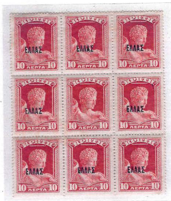
101. (1907) missing overprint error (B66); dot at the bottom half of E (B67) and right leg of A cut (B76) varieties

The item also displays the unrecorded in the philatelic literature for Plate B variety dot in the lower half of E , on position 67.