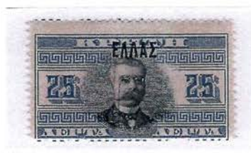
25l. first Λ less broken at top (A)

First Λ less broken at top, position 64 (small sized values)