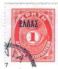
1l. postage due stamp, first Λ less broken at top (A64)