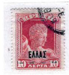
10l. (1907) series of dashes under the overprint (C14)