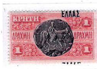
1dr. misplaced overprint