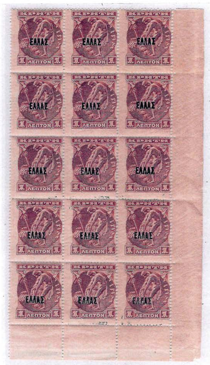
11. Plate C, right leg of A cut (C69) and second Λ wide (C80) varieties

The variety right leg of A cut (B76) appears in the case of Plate C on position 69 , but the position of the variety second Λ wide remains constant in relation to Plate B ( position 80 ).