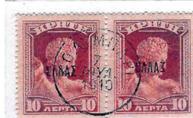
10l. (1907) inverted Σ error (B35) TK

It is noted that, unlike the postmark of the post office of ΣΟΥΔΑ (Souda) which appears very often on stamps with private ΕΛΛΑΣ (1908) overprints, the ΚΟΛΥΜΠΑΡΙ (Kolymbari) postmark appears in cases of stamps with genuine overprint errors.