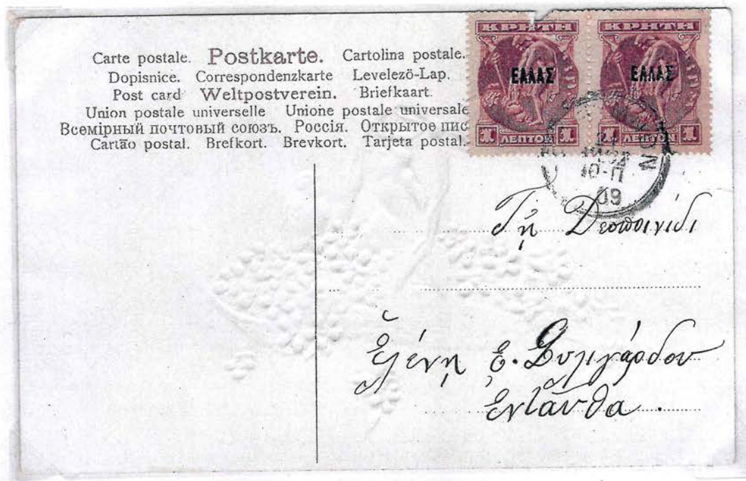
1l. right leg of A cut overprint variety (C69)

In the last phase of the overprinting process (plate D), the specific typographic element shows the image of 'mutilation' due to further wear.