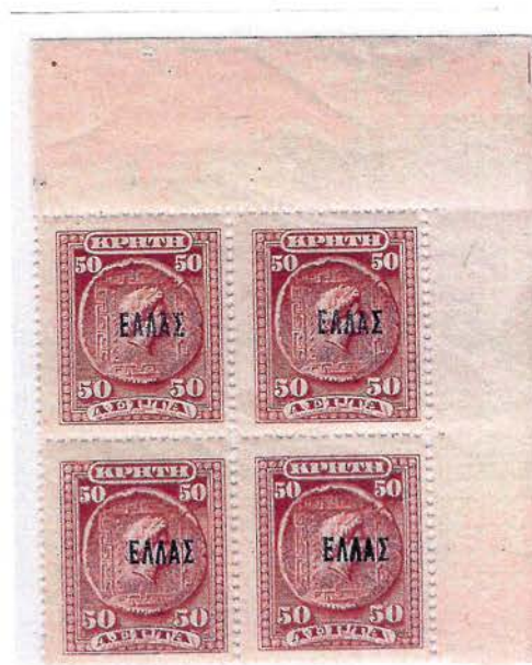
50l. second Λ from a bolder font (A20)