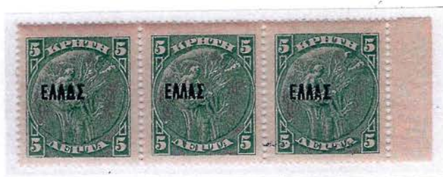
5l. ΕΛΛΑΣ error (B48)