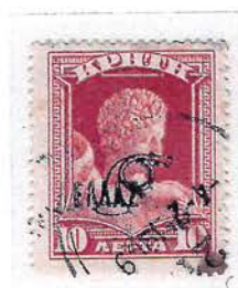
10l. (1907) foot of E short (B38/C)

the overprint may have resulted from the use of Plate C .