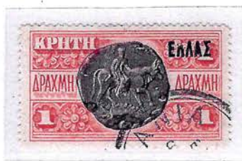
1dr. first Λ much broken at top (A13)