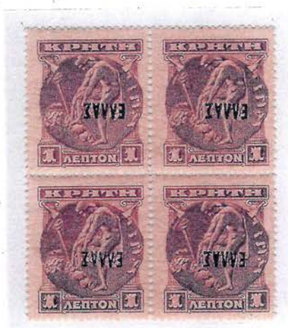
1l. inverted overprint (C), positions 66-67, 76-77

The use of Plate C did not result in setting or printing errors, only the error of the inverted overprint at the value of 1 lepton.