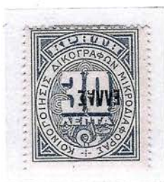
30l. stamp for official use, inverted overprint error and right leg of A cut variety (B25)

The overprint variety right leg of A cut will be presented later in the exhibit.