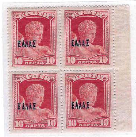
10l. (1907) right leg of A cut (C69)

On certain stamp values, Plate C shows deterioration in its typographic elements compared to Plate B.