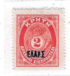
2dr. postage due stamp, right leg of A cut (B76)