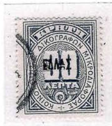
30l. stamp for official use, right leg of A cut (B76)