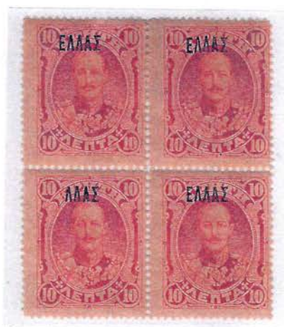
10l. (1900) _ΛΛΑΣ error (A34)

During the overprinting process with Plate A the error _ΛΛΑΣ on position 34 also appeared.