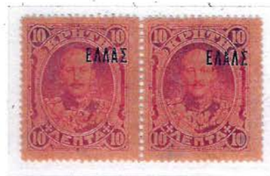
10l. (1900) ΕΛΛΑΣ error (A30)