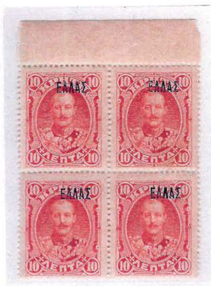
10l. (1900) second Λ from a bolder font (A20)

Second Λ from a bolder font, position 20 (small sized values)