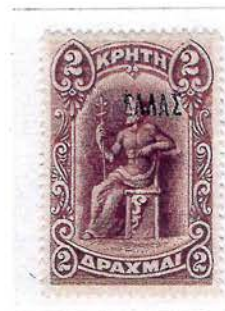
2dr. top of first Λ split (A)

Foot of E short, positions 60 (small sized values), 51 (horizontal stamps) και 38 (2 drachmae value)