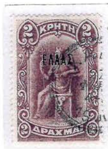
2dr. foot of E short (A38)