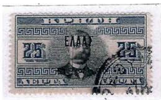
25l. top of first Λ split (A)

Top of first Λ split, position 54 (small sized values)