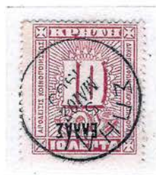
10l. stamp for official use, inverted overprint error (A)

Finally, the use of Plate A also resulted in the error of the inverted overprint on the 10l. value of the stamps used for the summon process for petty legal disputes.