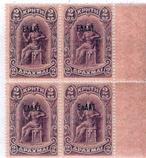
2dr. first Λ much broken at top (A70)

First Λ less broken at top, position 64 (small sized values)