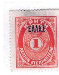
1l. postage due stamp, head of Σ bending downwards (A75)

Second Λ from a bolder font, position 20 (small sized values)