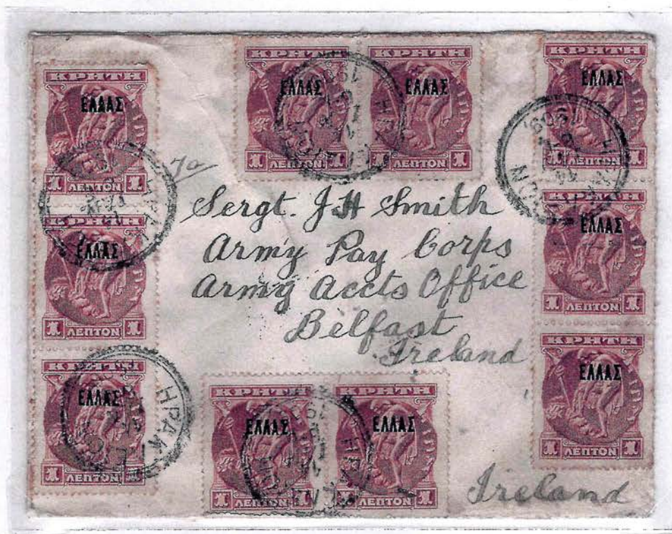
1l. series of dashes under the overprint (C14)