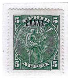
5l. ΕΛΛΑΣ error (A30)

The first values that were overprinted and display the ΕΛΛΑΣ error are those of 5 and 10 lepta (1900).