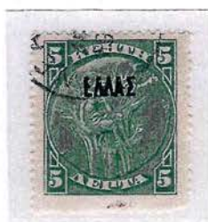
5l. head of E cut (C2)

Head of E cut, position 2 and series of dashes under the overprint, position 14