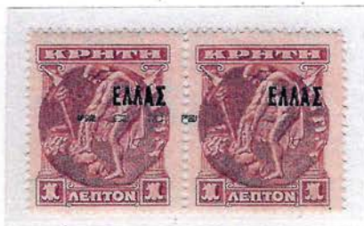
1l. series of dashes under the overprint (C14)