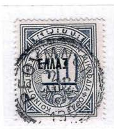
30l. stamp for official use, inverted Σ error (B35)

The 2 setting errors that resulted from the use of Plate B are those of the inverted Σ on position 35 and of ΕΛΛΑΣ on position 48 .