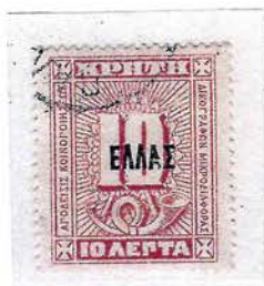
10l. stamp for official use, right leg of A cut (B76)