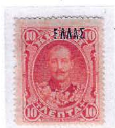
10l. (1900) foot of E short (A60)

Foot of E short, positions 60 (small sized values), 51 (horizontal stamps) και 38 (2 drachmae value)