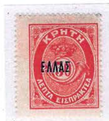
50l. postage due stamp, foot of E short (A60)