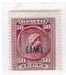
50l. head of Σ bending downwards (A75)